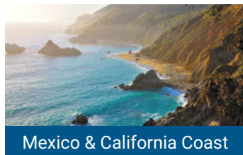
Mexico & California Coast