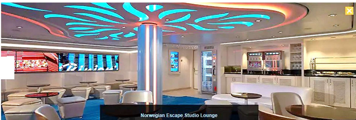
Norwegian Escape Studio Lounge

As a Studio guest, you will have exclusive key card access to the Studio Complex and Lounge. This shared private area is where you can stretch out, have a drink, order room service, watch the big-screen TV and meet your neighbors.