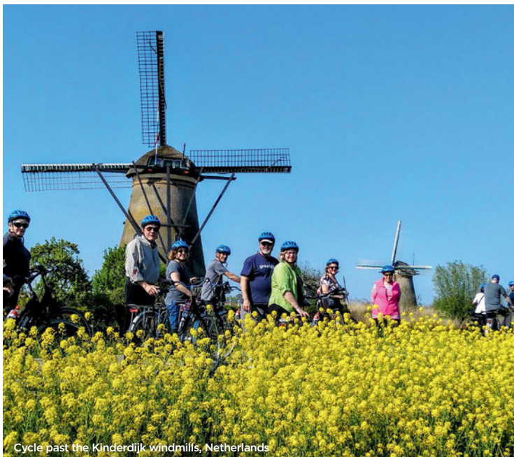
Cycle past the Kinderdijk windmills, Netherlands

Cat. AA+ stateroom has no bathtub and other modifications